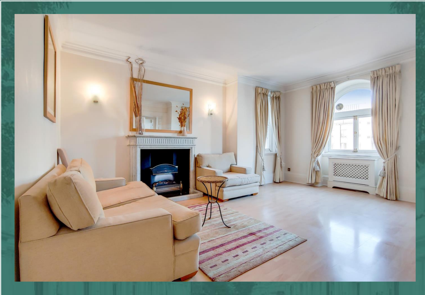
Berkeley House, Hay Hill, Mayfair, London W1J Asking Price of £825,000